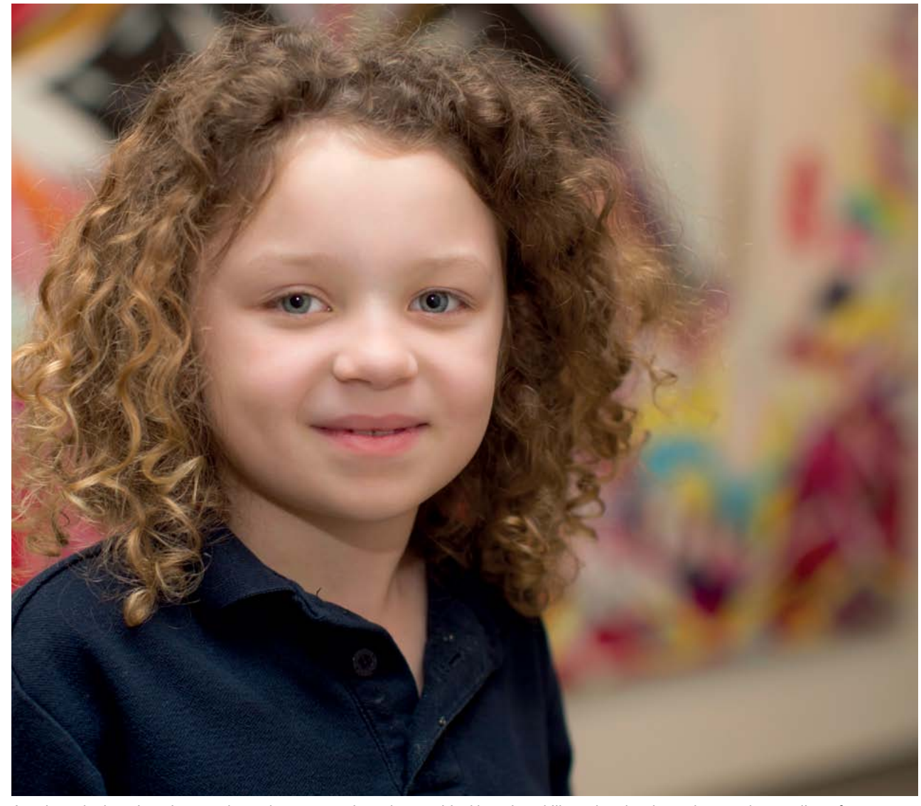
Arts-based education gives students the opportunity to hone critical learning skills and to develop a deep understanding of art