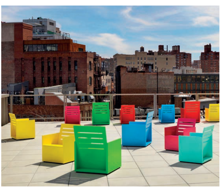
Installation view of Mary Heilmann: Sunset (Whitney Museum of American Art, New York, May 1 – September 27, 2015)

Deutsche Bank has a long association with the Whitney Museum of American Art in New York City. The Bank has sponsored several exhibitions at the museum, including the last five Whitney Biennials, recognized as one of the most important shows on the US contemporary art calendar. Deutsche Bank has also been an active supporter of the