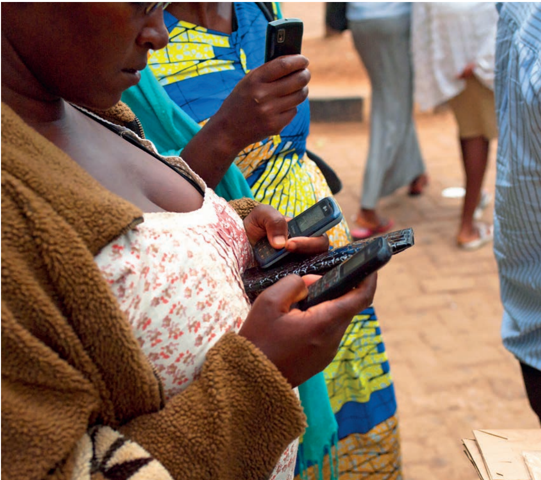
The mobile phone brings financial inclusion to unbanked communities