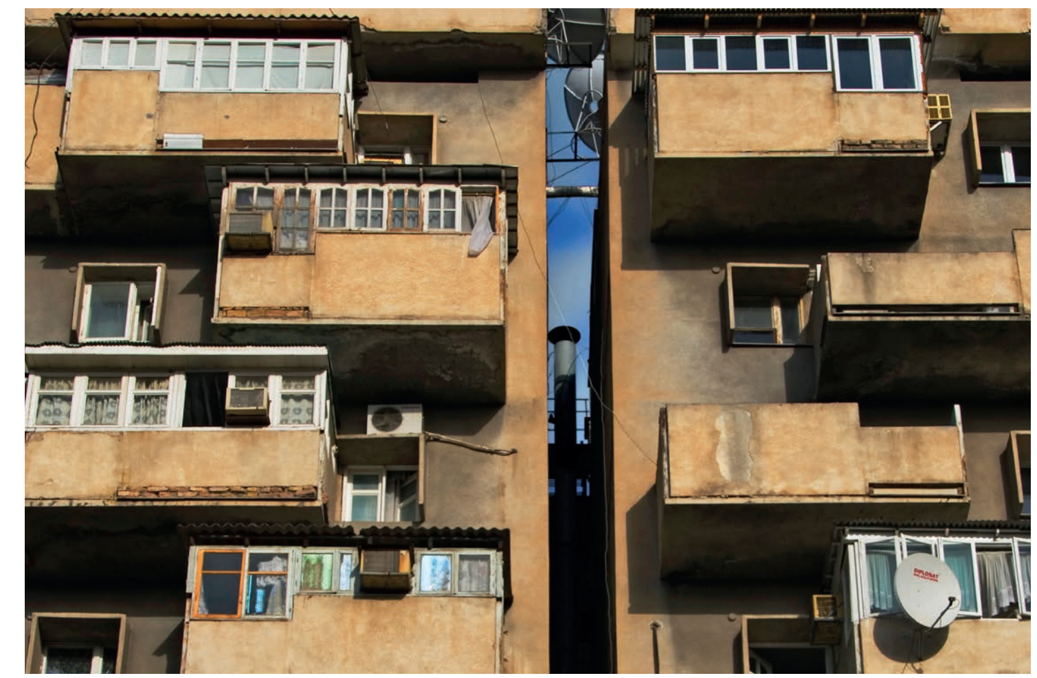
Making homes more energy efficient improves the economic situation of low-income communities in Tajikistan

Agence Française de Développement, Calvert Foundation, Church Pension Fund, Cisco Foundation, Deutsche Bank, Left Hand Foundation, MetLife, Inc., Posner-Wallace Foundation, Prudential, Salvepar, Swedish International Development Cooperation Agency, The Multilateral Investment Fund (member of the Inter-American Development Bank Group), Tikehau Capital