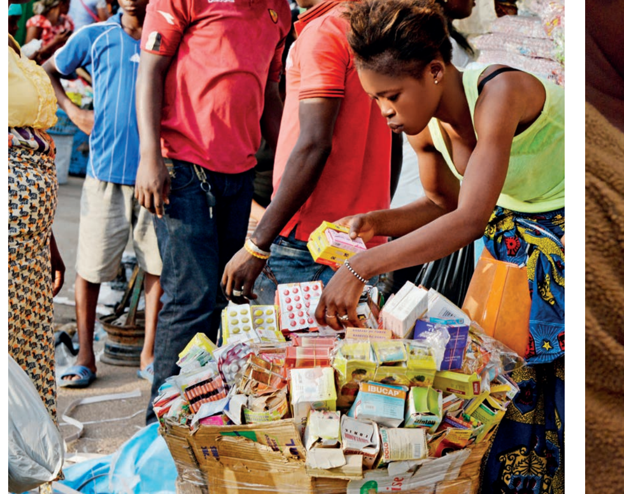
Counterfeit medicines may be ineffective or even harmful