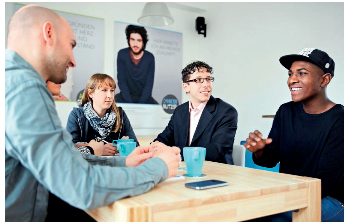
Social entrepreneurs are mentored at the Social Impact Lab in Berlin