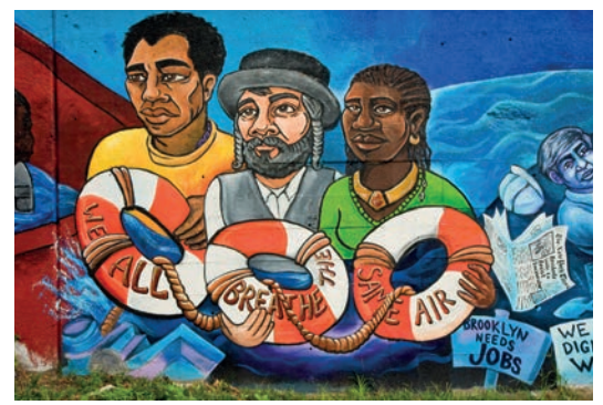
A mural at the Yard celebrates its history and future

The Commons will be open to the 3,000 workers of the renovated Building 77, creating networking opportunities that support job growth. Construction is expected to be complete in 2016