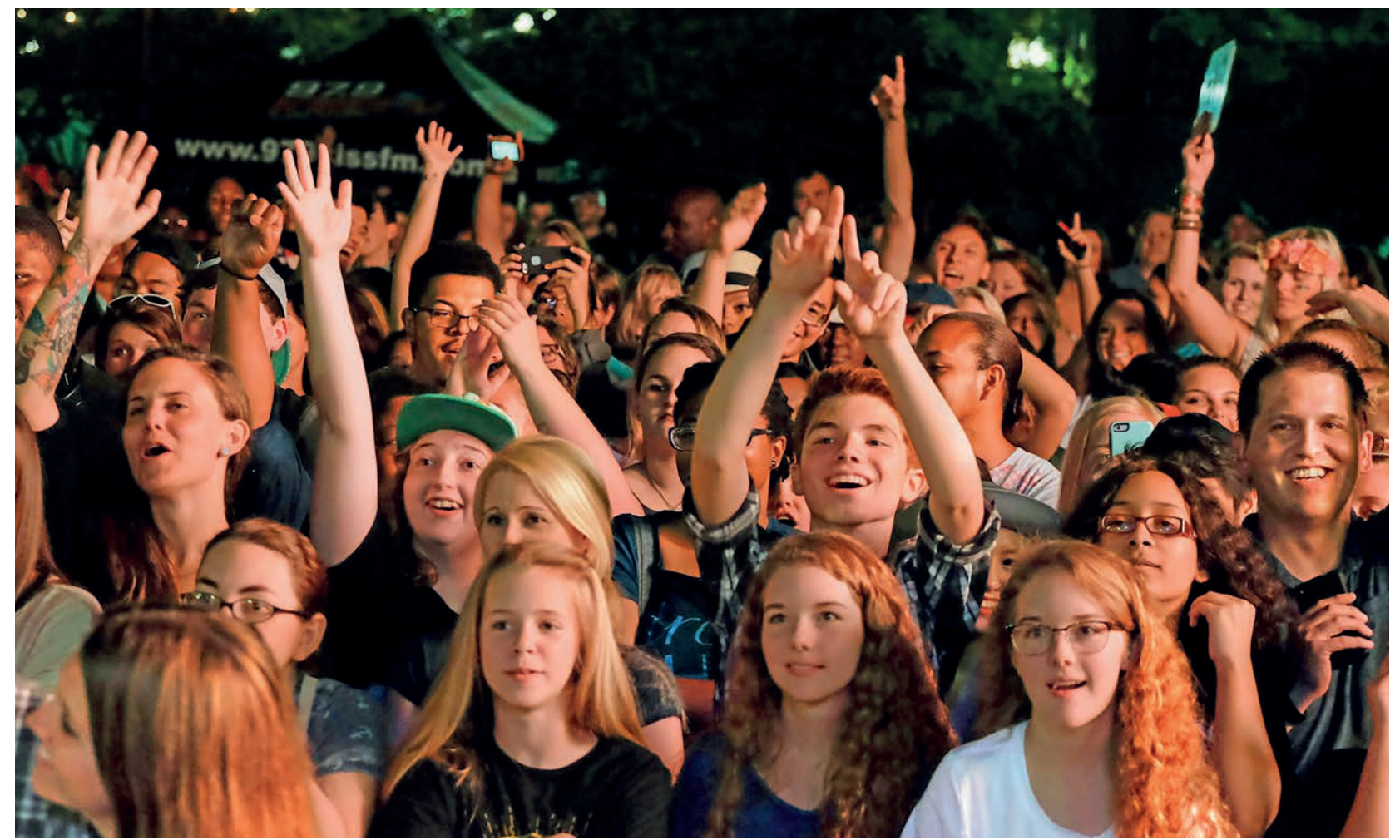
Deutsche Bank sponsored the world's largest crowd funding festival, One Spark, which took place in Jacksonville, FL and saw crowds of over 320,000. More than 300 Deutsche Bank volunteers contributed to One Spark and #EdSpark activities over the course of the week.

"Deutsche Bank is focused on hiring talented people that will contribute in driving innovation and digitization. We share One Spark's vision for fostering an environment of innovation and creativity"