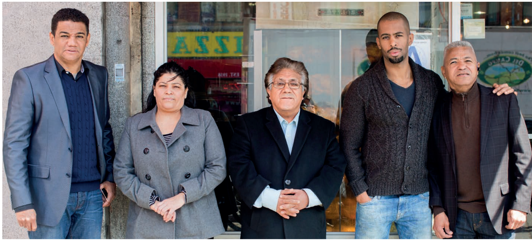
Founding members of SoBRO's United Business Cooperative, winner of Competition THRIVE 2014

"Immigrant entrepreneurs often face difficult and unique hurdles when trying to start and grow their businesses, and with programs like Competition THRIVE, we demonstrate our commitment to supporting the immigrant communities and businesses that are vital to a sustainably growing economy"