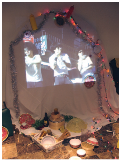
Cao Fei; Hip Hop New York , 2006; Mixed media with audio-video projection.

annual Summer Artist Residency program to create site-specific installations in its new building and on its grounds in Watermill, Long Island. The five installations and artists-in-residence were sponsored by Deutsche Bank.