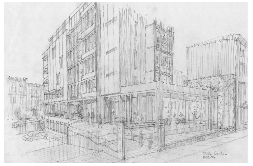
The Community League of the Heights (CLOTH) is developing a 570-student school with its partner, New Visions. A community center is also being developed on the site. By combining the two, CLOTH hopes to create an accessible community resource that leverages the programs of both facilities to the mutual benefit of each, as well as the neighborhood itself.

State-of-the-art libraries. Studios for neighborhood artists. Space for community meetings. A green market in a low-income neighborhood. New schools with sustainable design.