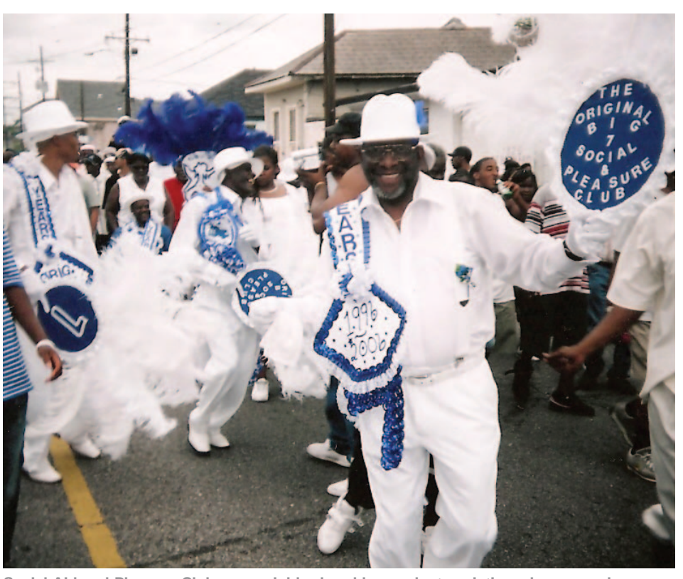
Social Aid and Pleasure Clubs are neighborhood benevolent societies whose members pay modest dues annually to support local cultural and social activities, such as Mardi Gras Indian Tribes and "second line" brass band parades. This parade in the devastated 7th Ward of New Orleans was the first since Katrina, and members drove in from across the United States to participate.

Deutsche Bank is funding its Katrinarelated projects through $1.8 million provided by the bank's investment banking division, which donated a day's trading fees for storm relief. Nearly $1 million was spent in direct aid immediately following the storm with the remainder being deployed through long-term rebuilding efforts.