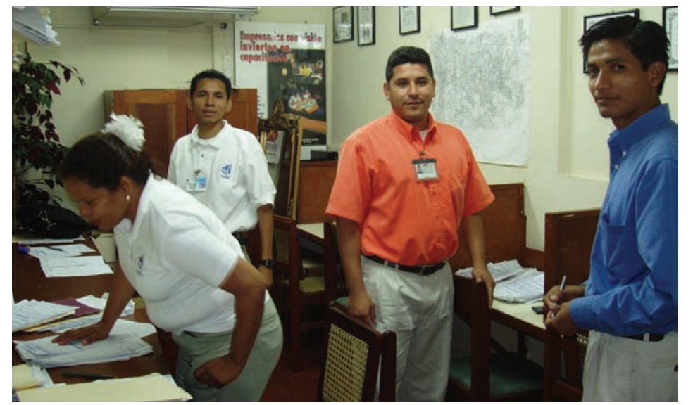
Team of loan officers at the Managua branch of the Consortium client FAMA prepare for visits to micro-entrepreneurs.

Microfinance has demonstrated its value for the self-employed poor in the developing world and is increasingly of interest to commercial investors. But what does microfinance look like up close?