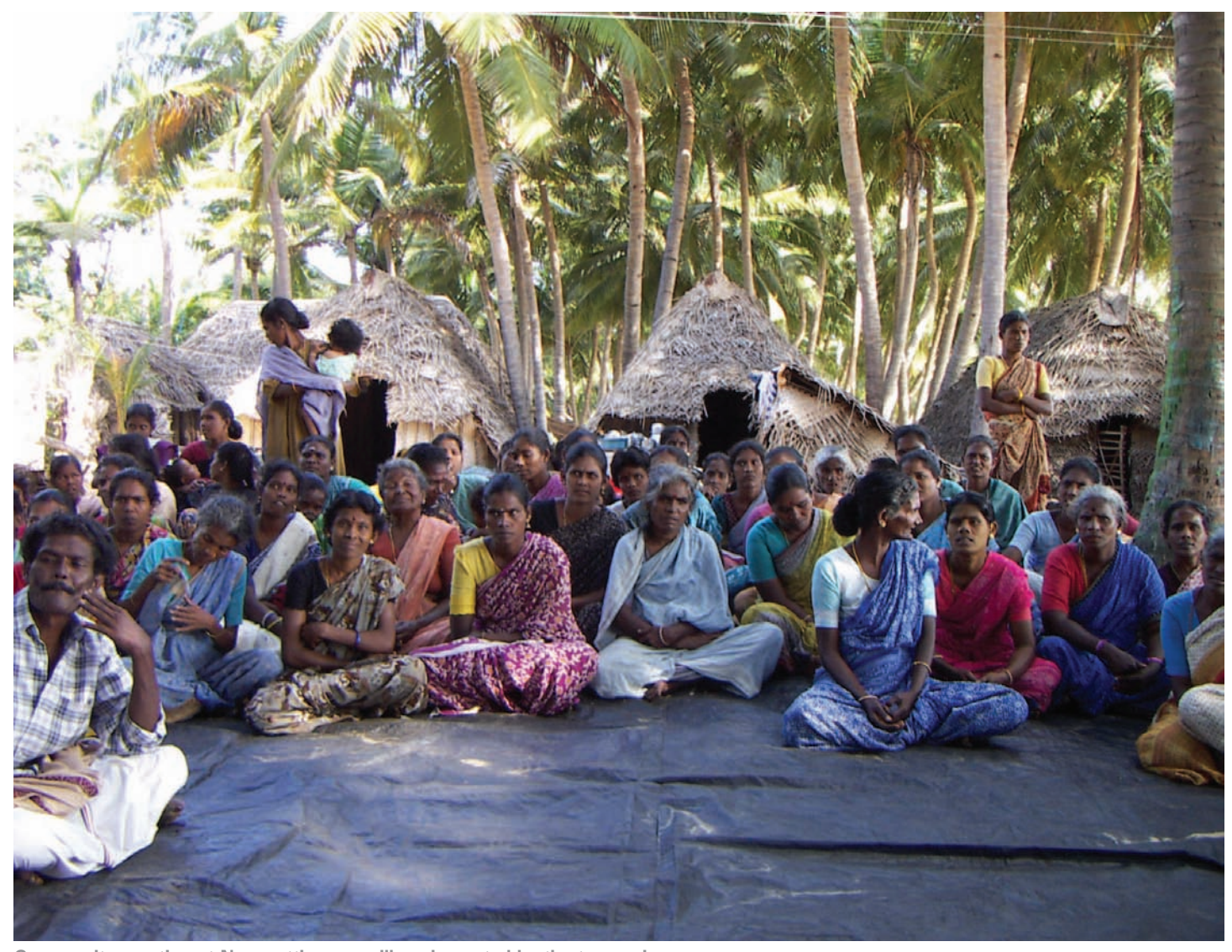
Community meeting at Nagapattinam, a village impacted by the tsunami.

With loans as small as $100, people are rebuilding their lives in tsunamiravaged regions of Southeast Asia.