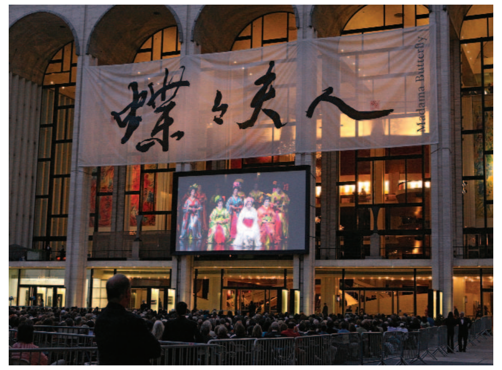
Deutsche Bank was the lead sponsor for the Met's Gala Opening Night performance of Giacomo Puccini's Madama Butterfly on September 25, 2006.

Arias about love and betrayal rang out on the streets of Manhattan in a first-ever public simulcast of a season-opening performance at the Metropolitan Opera.