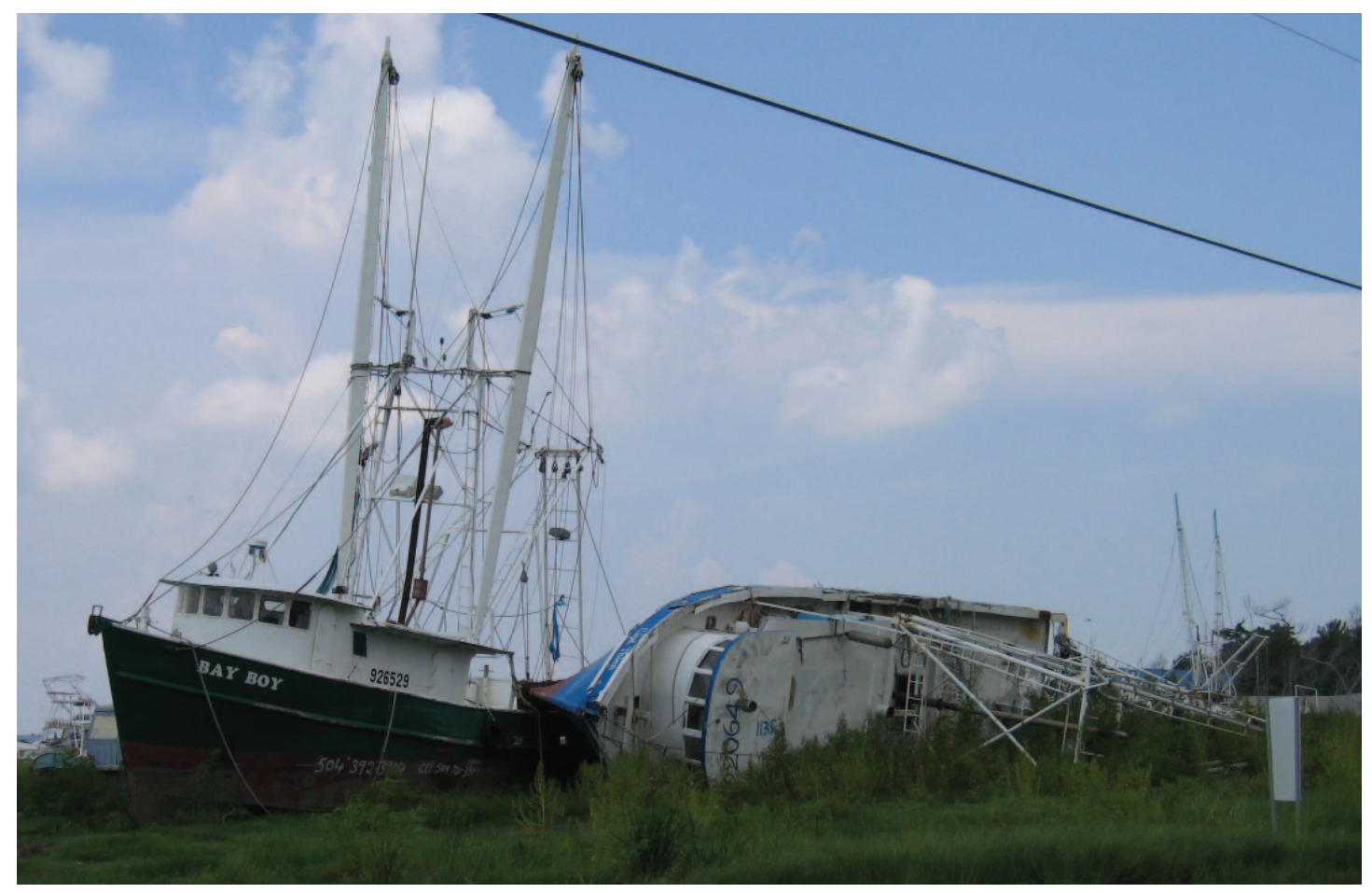
These shrimp boats were once the livelihood of Vietnamese-American fishermen in Venice, Louisiana. Fortunately, the fishermen are now receiving small business technical assistance from Seedco Financial Services to develop recovery strategies and new business plans. Seedco's efforts are funded in part by Deutsche Bank.

Hurricane Katrina devastated more than New Orleanians' homes and livelihoods. The ferocious storm also left a hole in the Crescent City's culture.