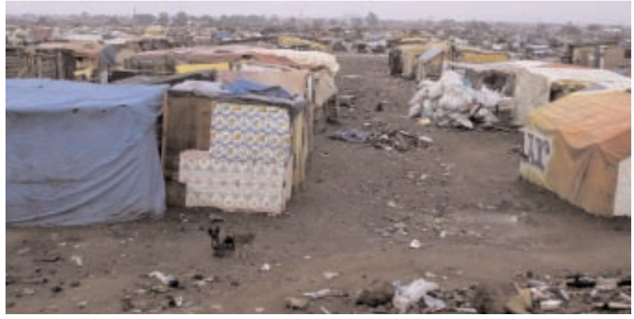
Makeshift homes of the "Pepenadores," who work and live in the Mexico City municipal dump

The Deutsche Bank Americas Foundation and Community Development Group carry out the Bank's corporate citizenship commitments in the Americas, partnering with local nonprofit organizations to revitalize distressed neighborhoods, improve public schools, and enrich communities with crosscultural exchange and access to the arts.