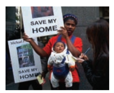
A resident protests predatory lending in a march sponsored by the Pratt Area Community Council

Community Development Corporations (CDCs) have been at the forefront of neighborhood revitalization efforts in New York City for the past 25 years. These efforts grew out of a clearly defined local mandate articulated by empowered and concerned neighborhood leaders. As CDCs have grown to become institutional leaders in their own right, they have struggled to maintain a