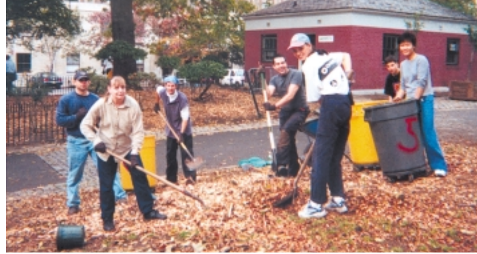
Deutsche Bank volunteers took part in a community-wide planting as a tribute to New York.

On a sunny Saturday morning in November, 24 volunteers from Deutsche Bank joined in a citywide initiative that will come to fruition next spring when New York will be awash in a sea of daffodil blossoms: a colorful tribute to those who died on September 11. These volunteers were part of the largest citizen-driven planting effort in the city's history: the planting of 1.5 million daffodil bulbs in parks, along highways, in community gardens, and in front of fire houses, police stations, libraries, and schools. The project was prompted by the generous donation of the daffodil bulbs to the city, which was once called New Amsterdam, by B&K Bulbs of Holland. In mid-October, thousands of crates of bulbs arrived by ship. Then the planting began, organized by the City of New York/Parks & Recreation, Partnership for Parks, the City Parks Foundation, the Parks Council, the Central Park Conservancy, the Coalition for New York City Parks, and scores of other park groups. From October 20 to November 11, hundreds of volunteers worked around the city