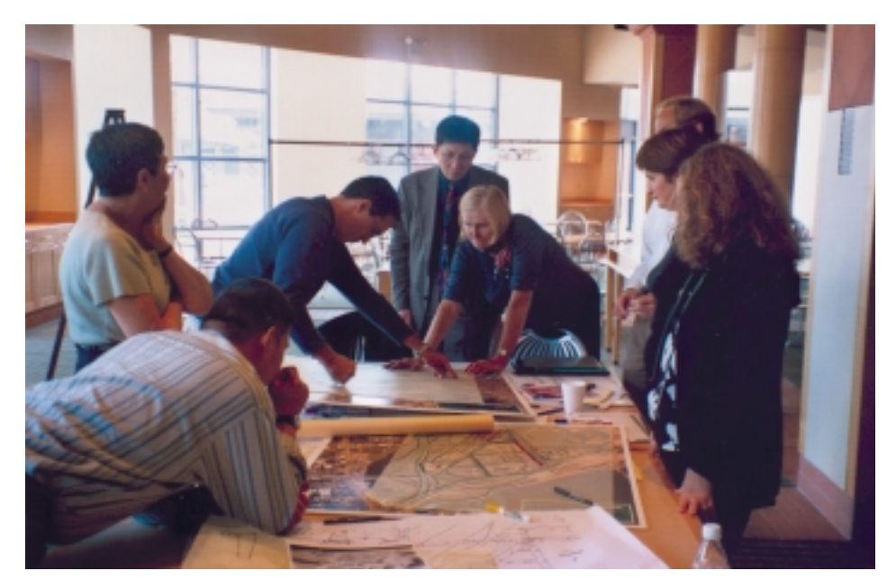
Workshop participants discuss possible design concepts for Willets Point.

took on an even larger challenge and organized another international brownfield design workshop this past October to consider the redevelopment options for Willets Point, a derelict 55-acre parcel of land in Queens. Architects, urban planners, German and Canadian brownfield experts, representatives from HPD, the Office of the Borough President of Queens, and community representatives came together to consider the future of the Queens site, which includes an extensive waterfront and is an exciting candidate for redevelopment.