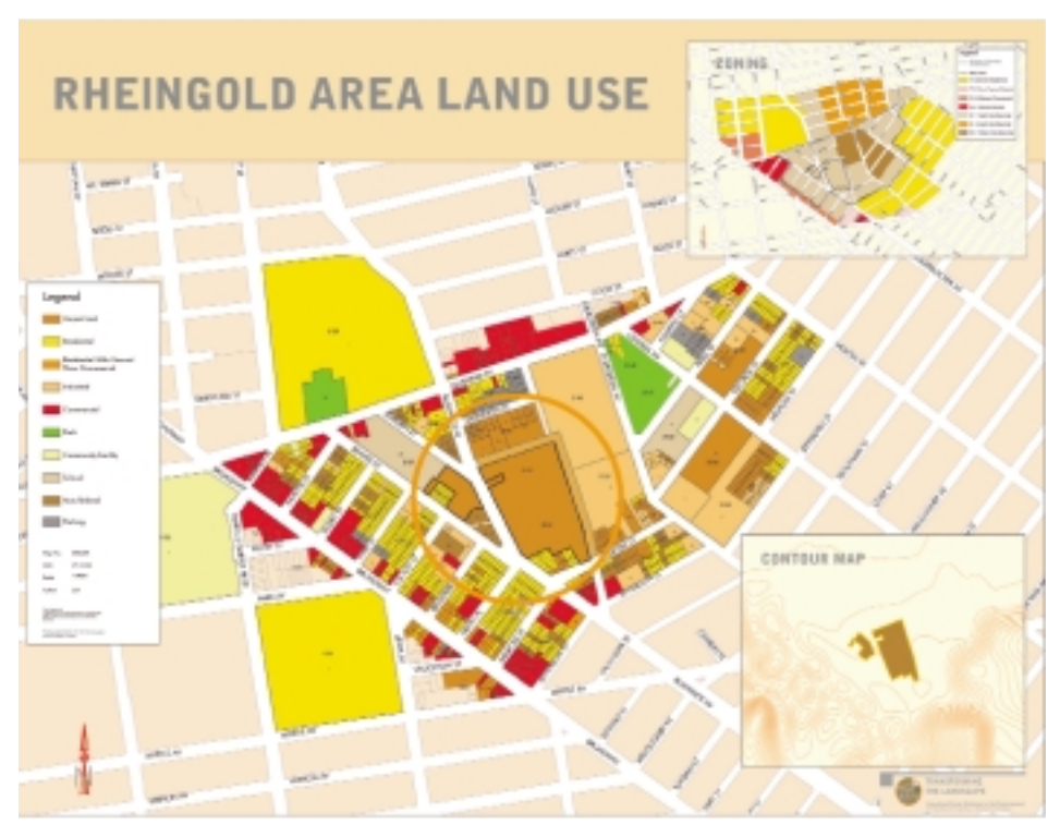
Plans for the redevelopment of the 6.7-acre former Rheingold Beer Brewery in the West Bushwick section of Brooklyn.

The project was so successful that the Waterfront Regeneration Trust and HPD, with support from Deutsche Bank and other sponsors,