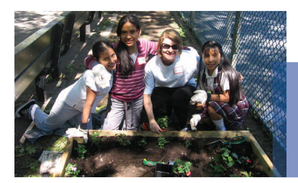
In May, teams from the IT Services division in both London and New York completed school-based community days. The New York volunteers worked alongside students from PS 57 in East Harlem to plant flowers and trees, and paint murals to help beautify the playground area.

Volunteerism: Deutsche Bank encourages employees to volunteer in the communities where they live and work. In recent months, employee teams have been especially active, giving time and energy to cleaning up parks, revitalizing schools, serving meals and more.