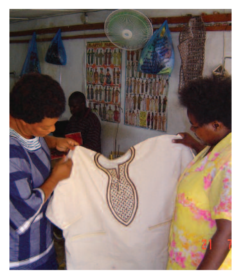
SELFINA clients supported through the Deutsche Bank Microcredit Development Fund produce authentic local designs in Tanzania.

A Tanzanian woman retired from an executive position knowing she and her family would have to rely on less than adequate benefits from the state social welfare program. Taking her family's future into her hands, she purchased several cows and opened a convenience store to strengthen the family's income. She then applied for financing from