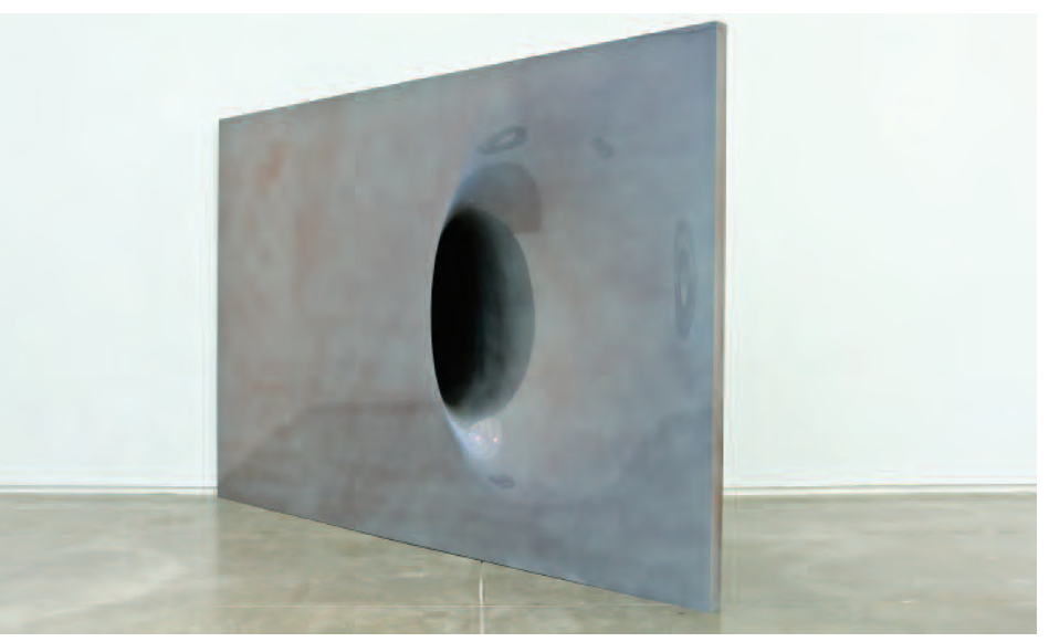
Anish Kapoor, Marsupial , 2006, Resin and paint, 96 \frac{1}{2} x 145 2/3 x 97 \frac{1}{4} in. (245 x 370 x 247 cm), Courtesy of the artist and Lisson Gallery. Photo: © John Kennard. © Anish Kapoor

The ICA show includes Kapoor's 1992 sculpture, "When I Am Pregnant," and "My Body Your Body" from 1993.