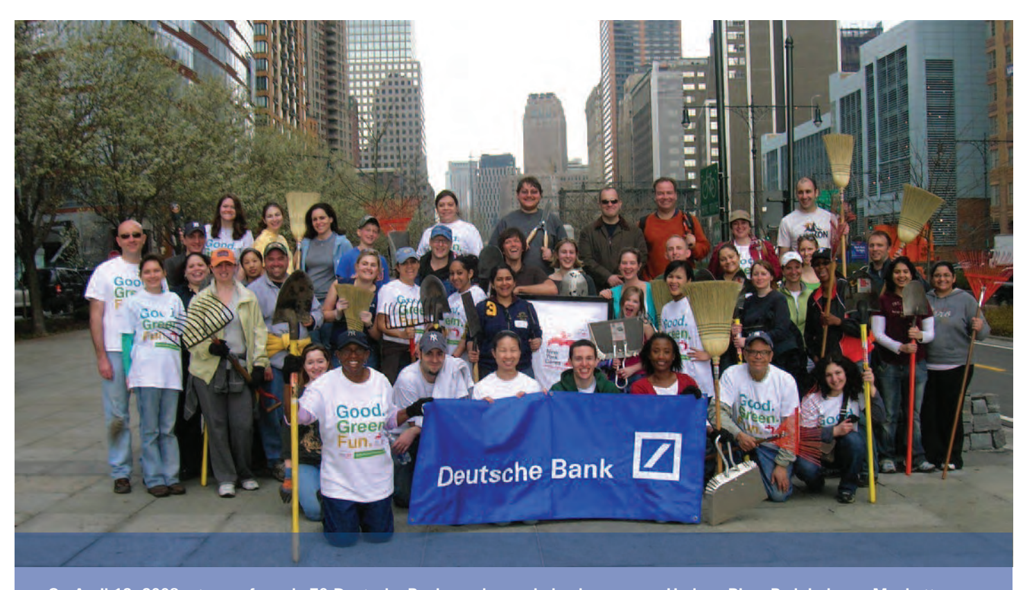
On April 12, 2008 a team of nearly 70 Deutsche Bank employees helped spruce up Hudson River Park in lower Manhattan as part of Hands On New York Day. The Deutsche Bank team also raised $1,000 to benefit event organizer, New York Cares. With the success and momentum of this event, the Bank looks forward to participating in the next city-wide service day, New York Cares Day, October 18, 2008.

Volunteerism: Deutsche Bank encourages employees to volunteer in the communities where they live and work. In recent months, employee teams have been especially active, giving time and energy to cleaning up parks, revitalizing schools, serving meals and more.