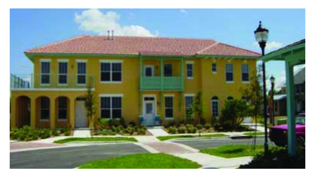
Community Development Trust provided a $3.4 million loan to purchase the first mortgage on Bradenton Villages, a 160-unit multi-family low-income rental property in Bradenton, Florida. Thanks to this financing, Bradenton Village was transformed from a deteriorating and flood-damaged public housing project into a welcoming place to live with new familysized apartments, attractive streetscapes, a swimming pool, a large community room, and an on-site day-care center. Lend Lease Mortgage Capital (LLMC), which originated the permanent mortgage, offers financing for conventional and low-income real estate properties throughout the U.S. By selling this mortgage to Community Development Trust, LLMC was able to mitigate its risk and redeploy its capital to finance other housing properties.

It was not too many years ago that nonprofit developers of affordable housing had no choice but to rely upon a hodgepodge of disjointed financing mechanisms to achieve their objectives. Particularly frustrating was a scarcity of equity sources and a "secondary market" able to absorb seasoned loans. While resources are still scarce, relative to enormous demand, the financial marketplace serving nonprofit developers has matured significantly. Deutsche Bank has recently provided financing to two entities that are at the forefront of building an efficient and liquid capital market for preserving and developing affordable housing.