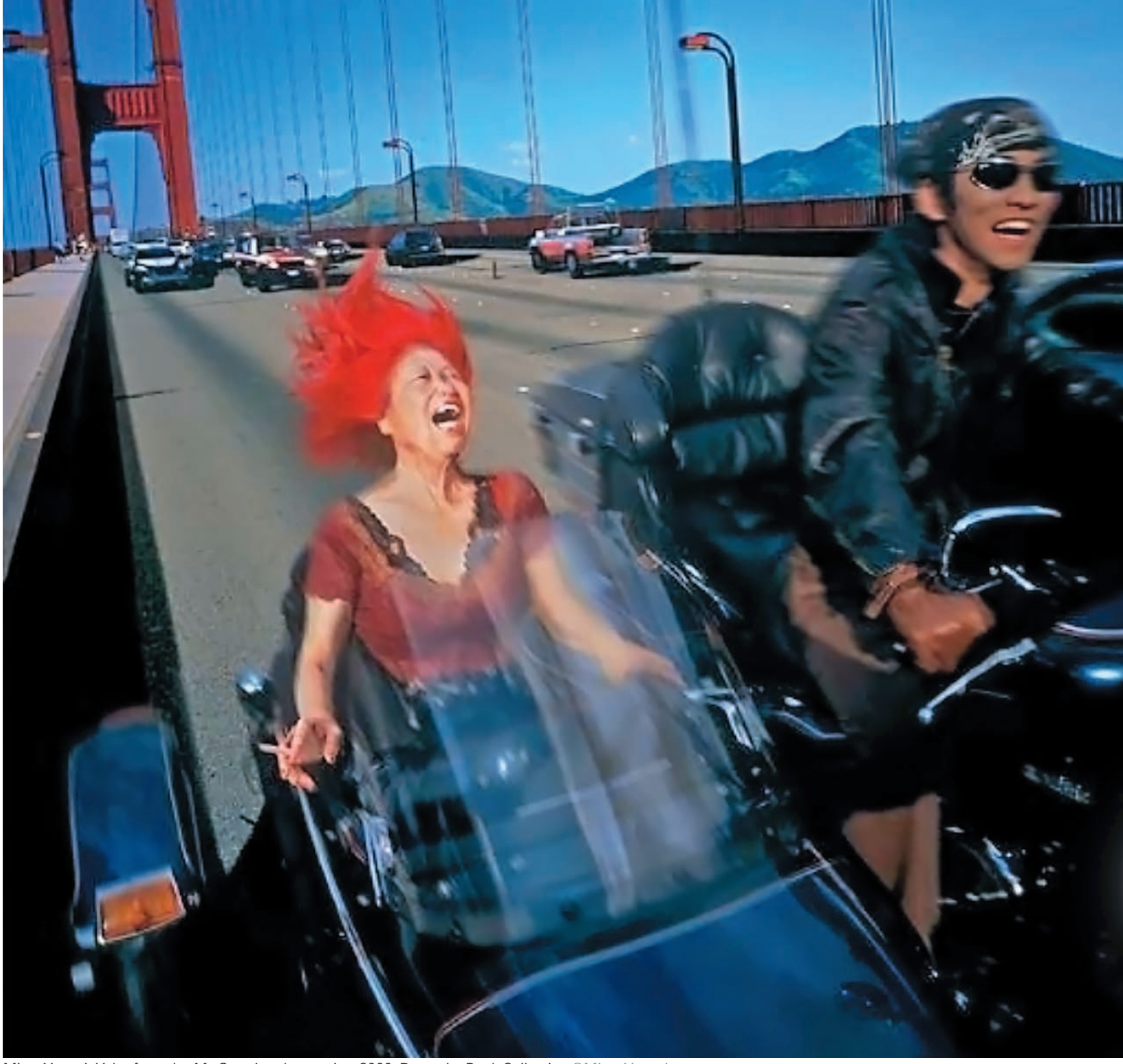
Miwa Yanagi, Yuka, from the My Grandmothers series, 2000, Deutsche Bank Collection @Miwa Yanagi