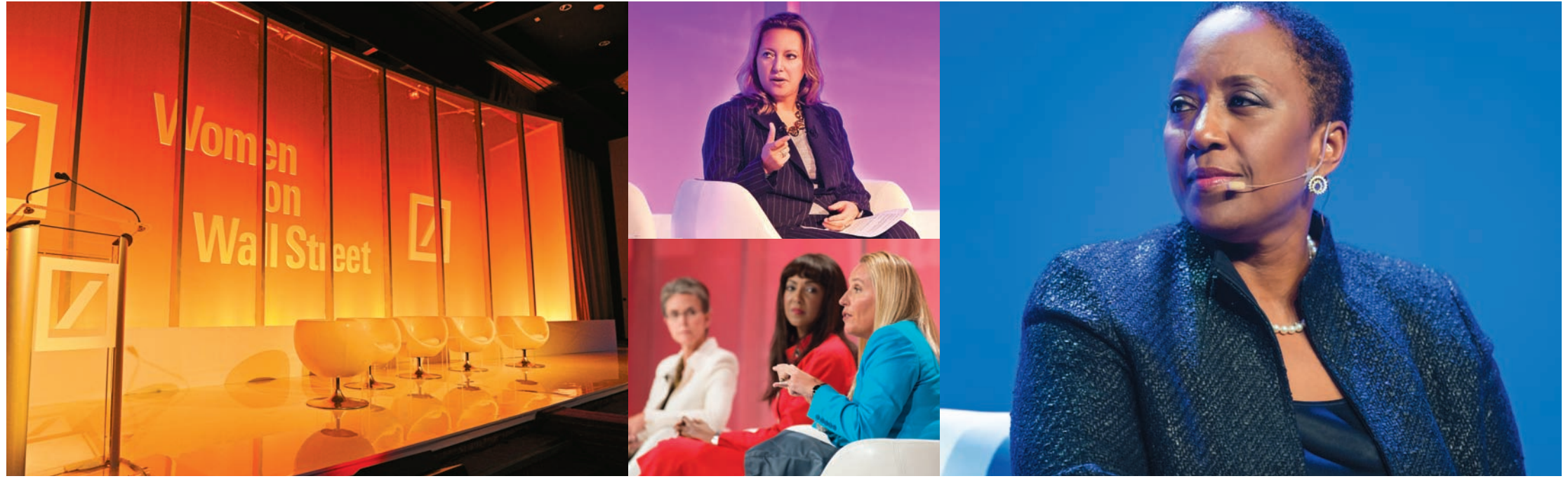
Vibrant and engaging for 20 years: scenes from the Women on Wall Street® conference

Deutsche Bank's Women on Wall Street® conference – or WOWS, as it's known – is the premier event for women working in finance.