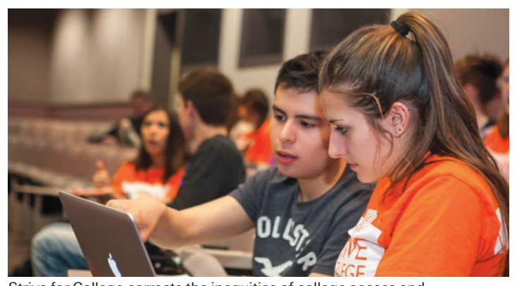
Strive for College corrects the inequities of college access and enrollment in the US

Deutsche Bank's Thought Leaders Forums are a series of events created to enrich understanding of challenging issues and involve bank employees in activating solutions. The Forums are part of Deutsche Bank's civic engagement on topics of importance to society at large. Each event gathers leaders from within the bank and from its corporate citizenship partners to create a dialogue on the issue on the agenda.