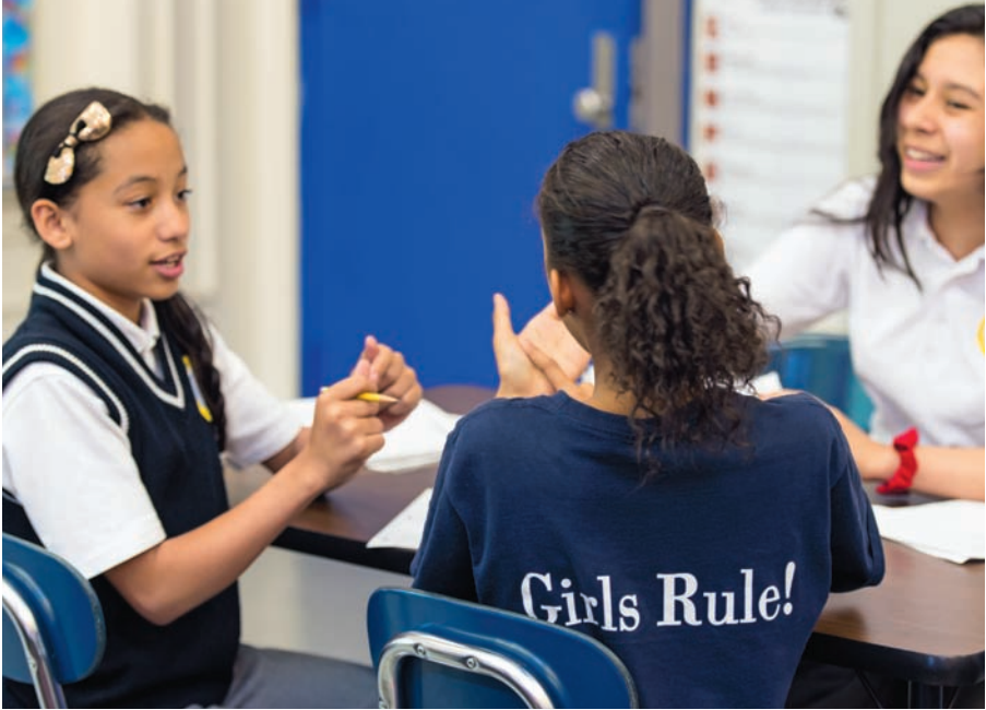
YWLN students

The one-week DB WGL program is designed with and delivered by faculty from INSEAD business school and includes leader-led development with the participation of GEC members and ATLAS participants.