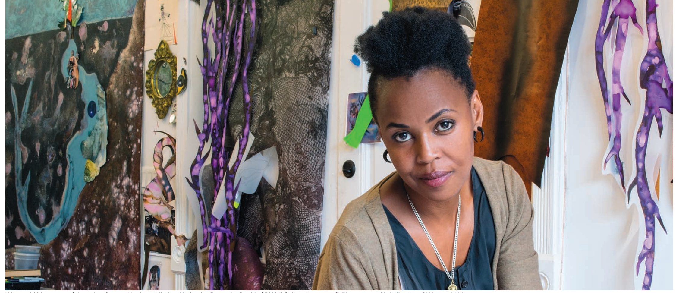
Wangechi Mutu, one of the artists featured in the exhibition Herland at Deutsche Bank's 60 Wall Gallery (see page 8)