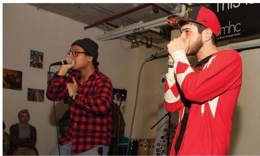
Gangway award presentation event

The BronxBerlinConnection enables young people from either side of the Atlantic to appreciate what they have in common