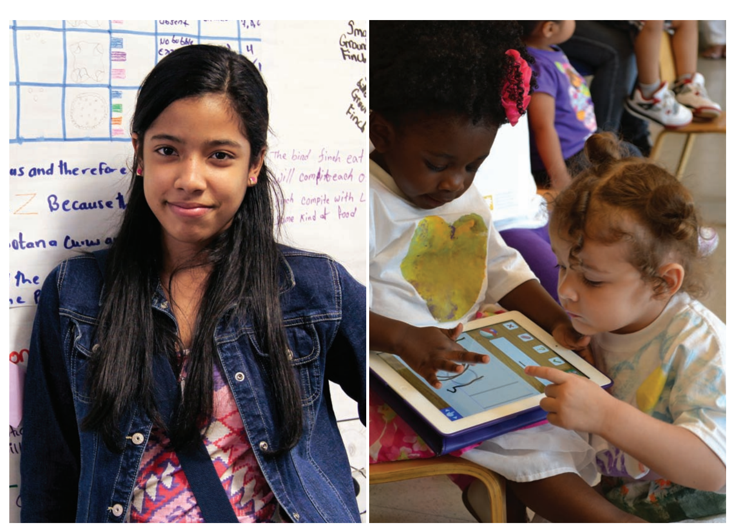
Anchoring Achievement in Mexican Communities supports high school students in learning activities that better equip them for advancement in the world of work, and provides young learners with the proper supports to be ready to enter and perform in school

The Friends are reminded of the ambitions that led them to where they are today. Their compatriots journeyed from Mexico fueled by a similar optimism about New York's possibilities. By building solidarity between them, the Anchoring Achievement project is helping to bring success a step closer. ■