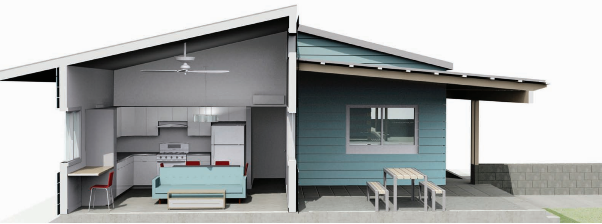
Alley Flat 3: Willow Street

Globally, there is an emergence of incredibly successful cities attracting new people and new investment. As certain urban and suburban neighborhoods have become more affluent, property values have increased dramatically. These changes result in gains for some and loss for others. A tale of two cities emerges: one of prosperity and new opportunity, and one of economic and demographic pressures and displacement.