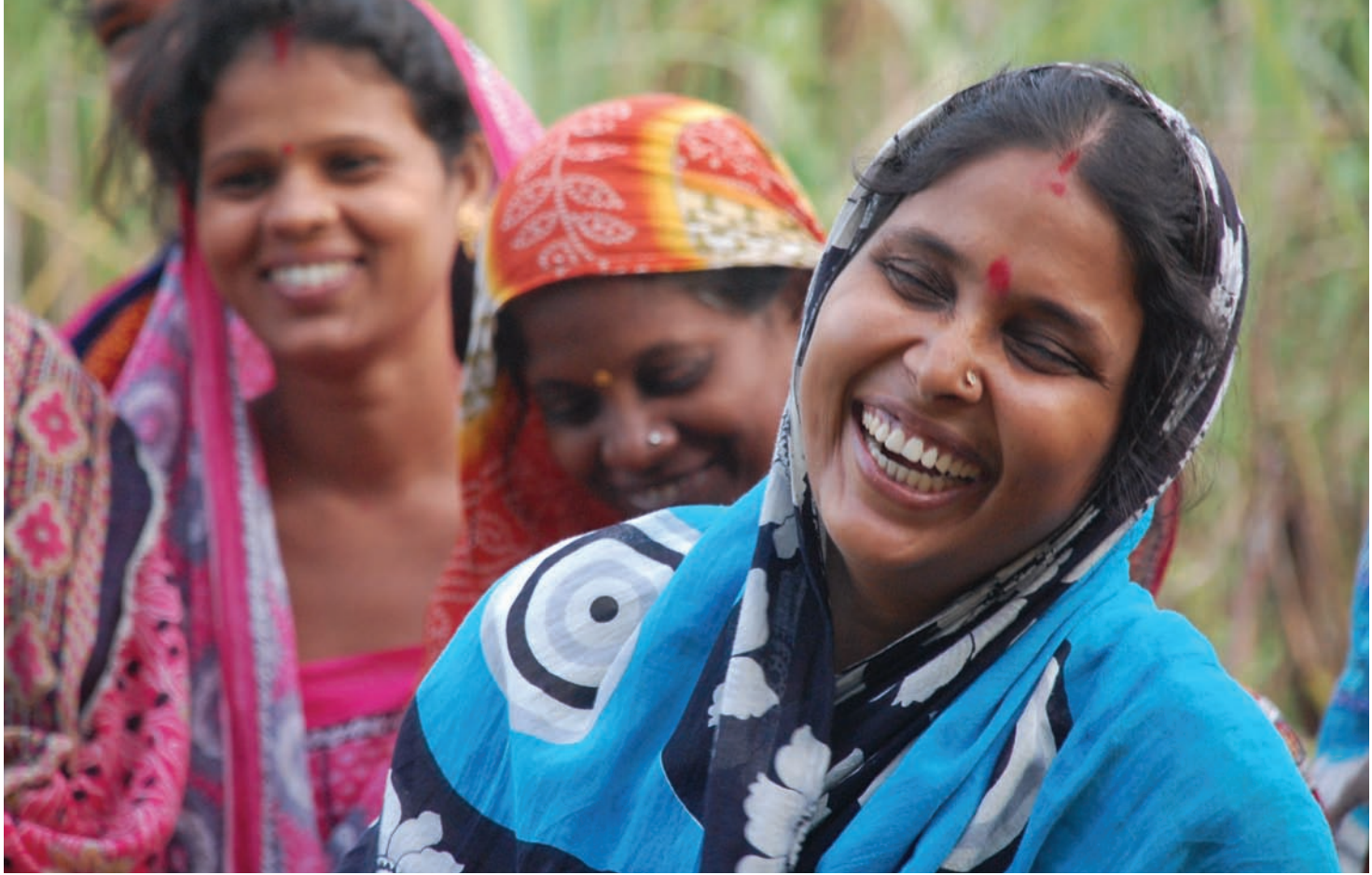
Kiva - funded entrepreneur

Deutsche Bank is working to be at the forefront of cultural change in its industry by combining a performance culture with a culture of responsibility. Values and guiding beliefs lie at the bank's core and shape employee behavior with clients, shareholders and the communities served.