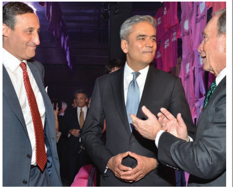
Annual Purim Ball 2013