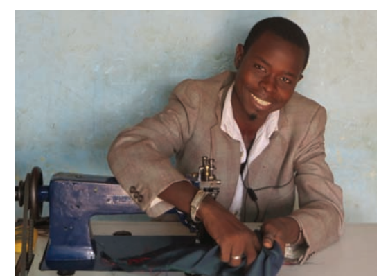
Kiva - funded entrepreneur

"There's a reason we wanted to do this first here at Deutsche Bank. Two decades in social finance, $2.5 billion deployed – that's a very real commitment. A lot more people are talking about impact investing as a result. To have a bank of this reputation play an early role means other people will follow"