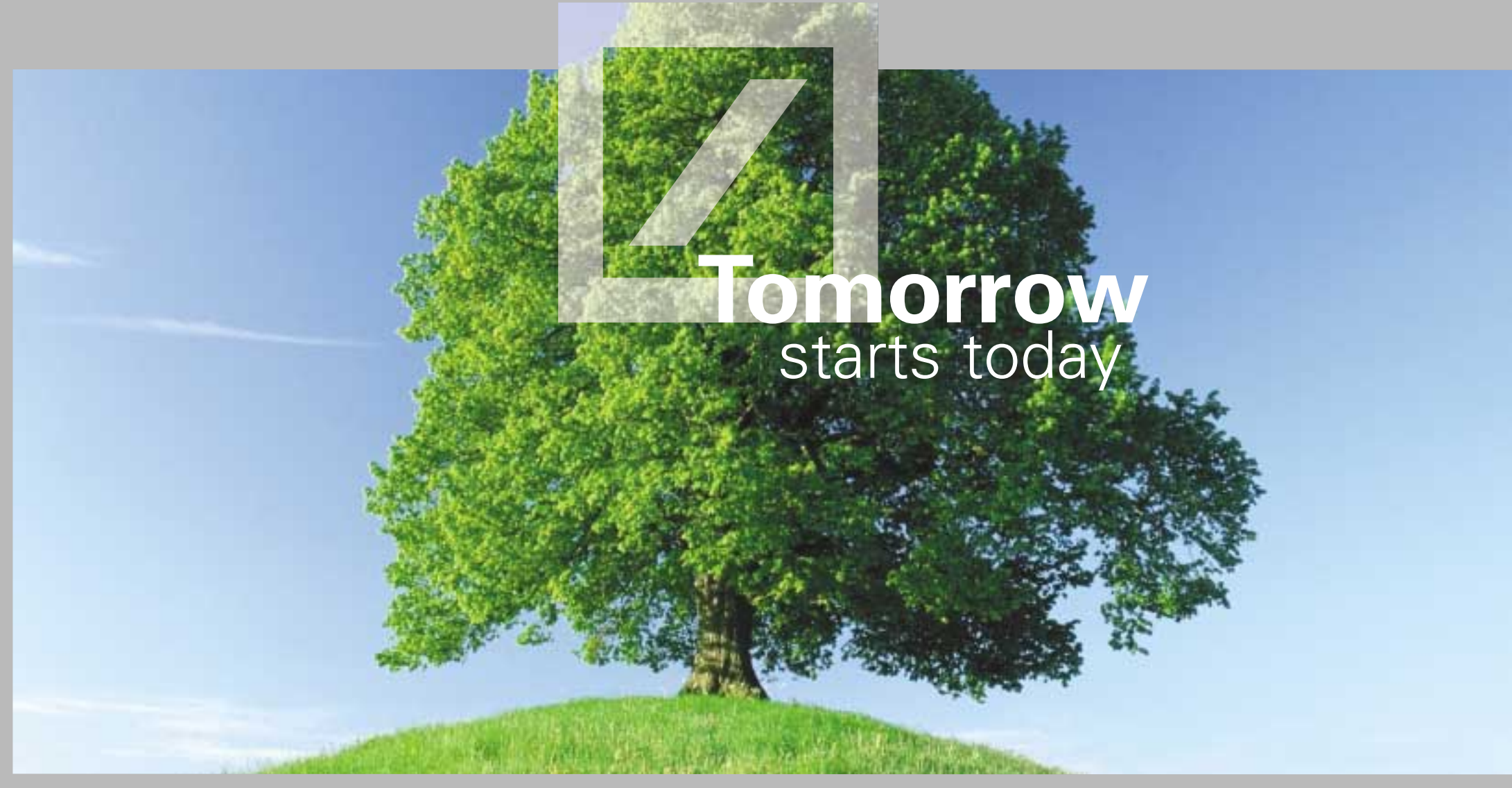
2004 Corporate Citizenship Report