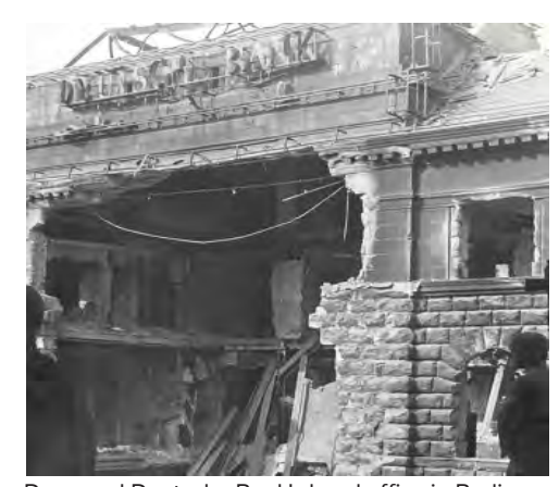
Damaged Deutsche Bank's head office in Berlin

In 1945, after 75 years in business, Deutsche Bank was on the verge of ruin.