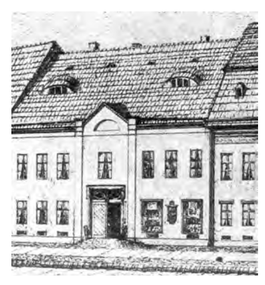
First premises at Französische Straße, Berlin

When Deutsche Bank started business on April 9, 1870 its first office was at 21 Französische Strasse in Berlin, on the first floor of a rather ordinary-looking building.