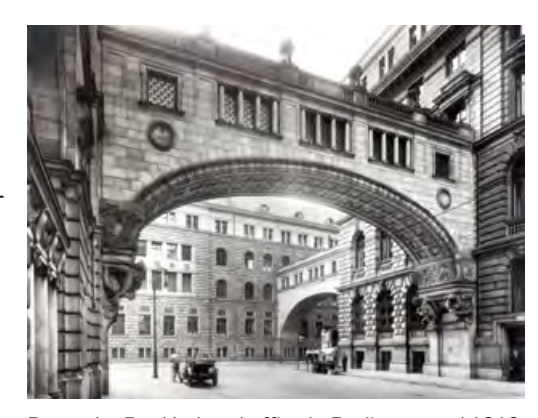
Deutsche Bank's head office in Berlin, around 1910

The bank remained there for just over a year and then moved, together with around fifty staff, to premises very near the Berlin Stock Exchange. In 1876, construction began on new head-office buildings at the junction of three streets – Behren Strasse, Mauer Strasse and Französische Strasse. The view of the two connecting "bridges" was to become something of a trademark for the bank.