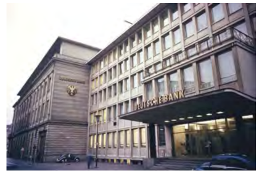
Deutsche Bank's head office in Frankfurt