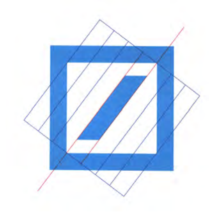
New logo of Deutsche Bank

International business grew far more important in the 1970s. Deutsche Bank began to take shape as a global group. New branches abroad supported this development. The evolution of financial markets, technological progress and the acquisition of major banks in Italy, Spain, the UK, and the United States have all meant that Deutsche Bank has changed more in the last decades than in the preceding century.