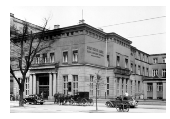
Deutsche Bank Katowice branch

As a bank with international connections and a branch of its own in neutral Turkey, in the period between 1942 and 1944 Deutsche Bank was also involved in the German Reich's gold transactions. During those years, Deutsche Bank purchased 4,446 kg of gold from the Reichsbank, selling it on in Istanbul. As we now know from the findings of the independent Historical Commission Appointed to Examine the History of Deutsche Bank in the Period of National Socialism, at least 744 kg of that gold came from Holocaust victims. However, no crystal-clear answer could be found to the question of whether the bank was aware of the origin of that gold.