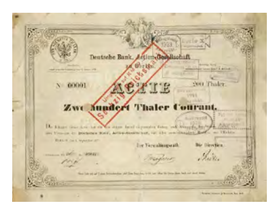
First share certificate of Deutsche Bank

The founders, all of them bankers. showed vision in choosing the name Deutsche Bank even before Germany had been established as a nationstate. However, little did they suspect that they were creating tough competition for themselves. In the long run, financing foreign trade was not viable on its own, so the newlyfounded bank was soon on the lookout for other areas of business.