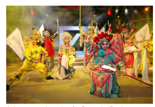
Asia - a growth market for Deutsche Bank

In 2008 Deutsche Bank had to overcome the most severe global financial crisis since the Second World War. In subsequent years several cases of rule breaches and misconduct were discovered that damaged the company's reputation. In early 2017 the Management Board issued a public apology for serious errors, for example in its US mortgage business activities between 2005 and 2007.