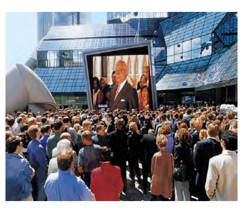
Completion of acquisition of Bankers Trust with 'closing day' on June 4, 1999

In the following years international investment banking accounted for an ever-increasing share of Deutsche Bank's business. Globalisation brought the capital markets even closer together. The liberalisation of economic areas and innovative technologies opened up new growth opportunities. Since then Asia in particular has seen new markets develop at breakneck speed.