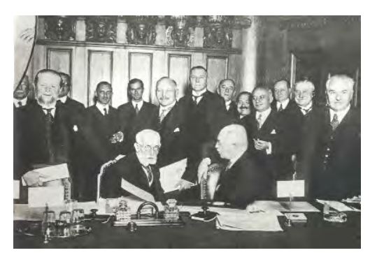
Merger of "Deutsche Bank und Disconto-Gesellschaft" 1929

For many years, it would not be possible to return to circumstances that might in some ways have been considered reminiscent of the 'golden age' before the First World War.