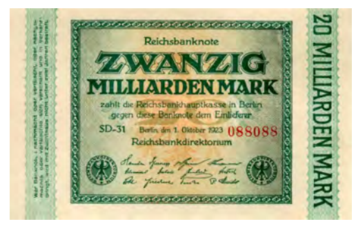
At the peak of inflation in 1923: banknote for 20 billion marks

After the First World War the banks had to come to terms with a very different world. Before business was able to recover, Germany was hit by inflation.