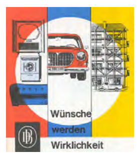
Bank advertising in 1960

The post-war period was a time of crucial decisions concerning banking policy. Product policy played a relatively minor role. This changed at the end of the 1950s when the bank ventured into general retail banking. Within a couple of years the number of private clients increased immensely, corresponding with strong growth in the domestic branch network.