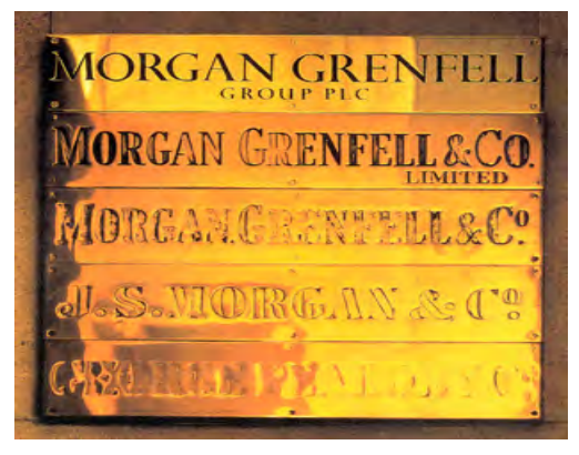
Acquisition of Morgan Grenfell in 1989

Starting with the acquisition of the UK merchant bank Morgan Grenfell in