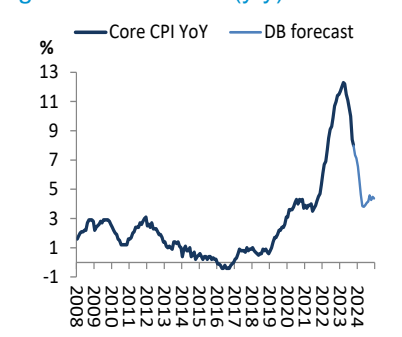
Figure 2. Core CPI (y/y)