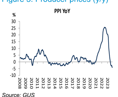
Figure 3. Producer prices (y/y)