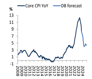
Figure 2. Core CPI (y/y)

Figure 3. NBP reference rate