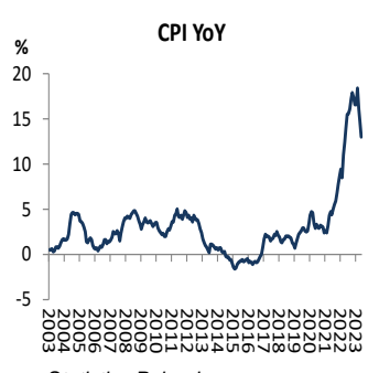
Figure 1. CPI (y/y)

Today the MPC start two-day policy meeting. We expect the MPC to keep interest rates unchanged with the main reference rate at 6.75% on Tuesday. In the communique after the meeting the Council will likely reiterate that their actions would be based on incoming data. We think that the MPC will underline fast decline in the main measures of inflation (including the beginning of decline in core inflation).