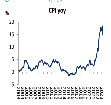
Figure 1. CPI (y/y)

Core CPI (ex food and energy) in April amounted to 1.2% m/m and 12.2% y/y. Core CPI fell from 12.3% y/y in March suggesting that core inflation has peaked in the end of Q1. Core inflation - excluding regulated prices - fell to 14.0% y/y in April from 15.7% y/y in March while core inflation - excluding most volatile prices - fell to 15.3% y/y in April from 16.0% y/y in March. Decline in headline inflation to 14.7% y/y in April from 16.1% y/y in March and moderate size of second round effects visible in rising services' prices, combined with appreciation of the zloty support a view that inflation will be heading towards single digit level in Q4 this year.