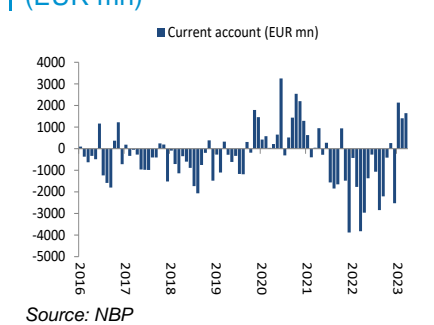
Figure 2. Current account (EUR mn)