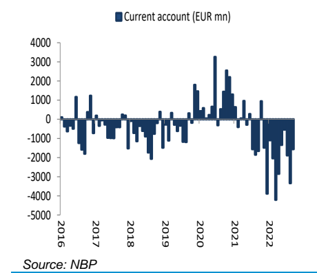
Figure 2. Current account (EURm)