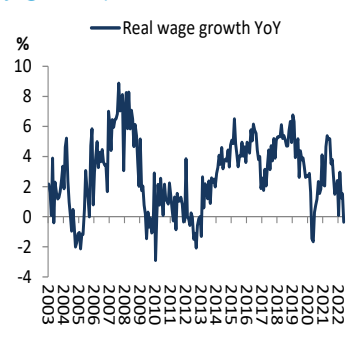
Figure 1: Real wage growth (y/y growth)

Money supply M3 rose by 0.1% m/m and increased by 7.6% y/y in May versus 0.2% m/m and 8.2% y/y growth in April. In May cash in circulation declined by 1.6% m/m and rose by 12.8% y/y while money supply M1 fell by 1.3% m/m and rose by 2.7% y/y. In May credit to households fell by 0.5% m/m and rose by 2.5% y/y while credit to companies fell by 0.1% m/m and rose by 12.2% y/y. Term deposits of households rose by 8.5% m/m and were 12.7% up y/y while term deposits of corporations were 7.9% up m/m and rose by as much as 69.3% y/y.