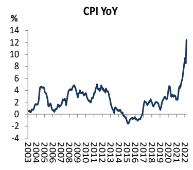
Figure 1: CPI (y/y change)

On Monday NBP releases core CPI for April. On Tuesday preliminary GDP for Q1 is due. On Friday data on average wage , average employment , industrial output and PPI for April will be published.