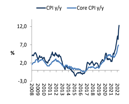
Figure 1: CPI and core CPI (y/y change)

On Thursday the MPC holds its policy meeting. We expect another 100 bps hike in interest rates due to sharp rise in inflation in April and expected further increases in energy prices.