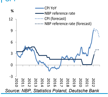
Figure 3. NBP reference rate and CPI