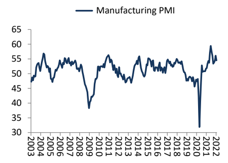
Figure 2. Manufacturing PMI