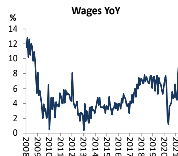
Figure 3. Nominal wage (y/y growth)