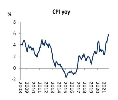
Figure 1: Inflation (y/y)

In August the current account gap widened to -EUR1.686bn from -EUR1.551bn in July and trade gap widened to -EUR1.413bn in August from -761mn in July. In August exports rose by 19.4% y/y to EUR21.8bn while imports increased by 32.9% y/y to EUR23.2bn. In August services account was positive(EUR1.8bn) while primary income account was negative (-EUR2.2bn) and secondary income account was slightly positive (EUR84mn). Widening of the current account gap in August resulted from strong growth in imports that increased trade gap.