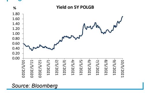
Figure 3: Yield on 5Y POLGB – long term trend