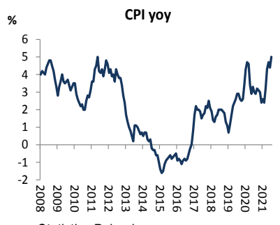
Figure 1: Inflation (y/y)

Core inflation for July amounted to 0.4% m/m and 3.7% and was marginally higher than market consensus view. On Wednesday data on average wage and employment in enterprises' sector are due. On Thursday industrial output and PPI for July will be released. On Friday data on retail sales and construction output for July will be published.