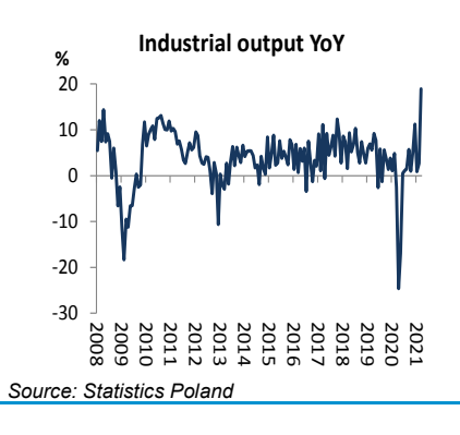
Figure 1: Industrial output (y/y growth)

In March nominal retail sales rose by 16.5% m/m and increased by 17.1% y/y while real retail sales rose by 15.0% m/m and were 15.2% up y/y. Such a strong growth in retail sales stemmed from much less restrictive lockdown in retail trade in 2021 than in 2020. In March real retail sales of automobiles and parts rose by 50.5% y/y, real retail sales of footwear and clothing rose by 93% y/y, real retail sales of consumer electronics and white goods rose by 39% y/y. A strong growth (+28.2% y/y) was reported in retail sales of newspapers, books and sales in specialized shops. In March growth in real retail sales of food was moderate (up 2.9% y/y). A decline in real retail sales was reported in fuels (down 0.6% y/y) and pharmaceuticals and cosmetics (down 2.6% y/y).