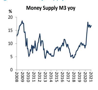
Figure 1: Money supply M3

Real GDP growth for Q4 was confirmed at -0.7% q/q and -2.8% y/y. In Q4 2020 personal consumption fell by 3.2% y/y, public consumption rose by 3.4% y/y, investments in fixed assets fell by 10.9% y/y. In Q4 exports rose by 8.0% y/y while imports increased by 7.9% y/y in real terms.