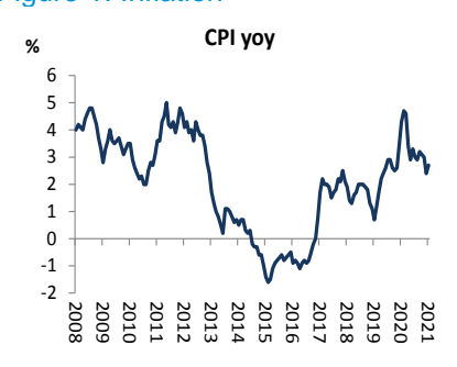
Figure 1: Inflation

Construction output fell by 10.0% y/y in January.