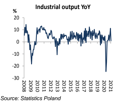
Figure 2: Industrial output (y/y growth)