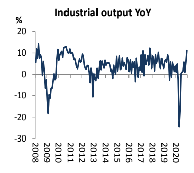
Figure 1: Industrial production (real y/y growth,)

Manufacturing PMI rose to 51.9pts in January from 51.7pts in December, slightly above expectations. On Wednesday the MPC holds policy meeting. We expect the MPC to keep settings of monetary policy unchanged, but MPC members' comments on policy guidance will be of interest.