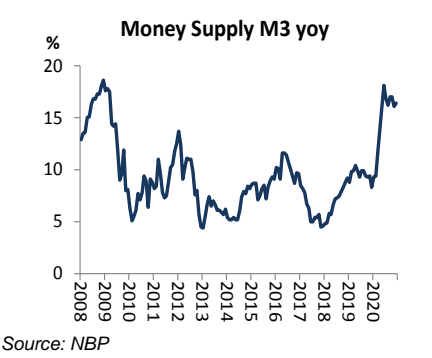
Figure 2: Money supply M3 (y/y growth)