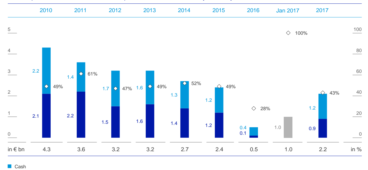
Year-end performance-based Variable Compensation and deferral rates year over year

Deferred Retention Award Program granted in January 2017 (€ 1.0 billion) including forfeitures (original grant value: € 1.1 billion), 100 % deferred. Retention Awards are not based on performance